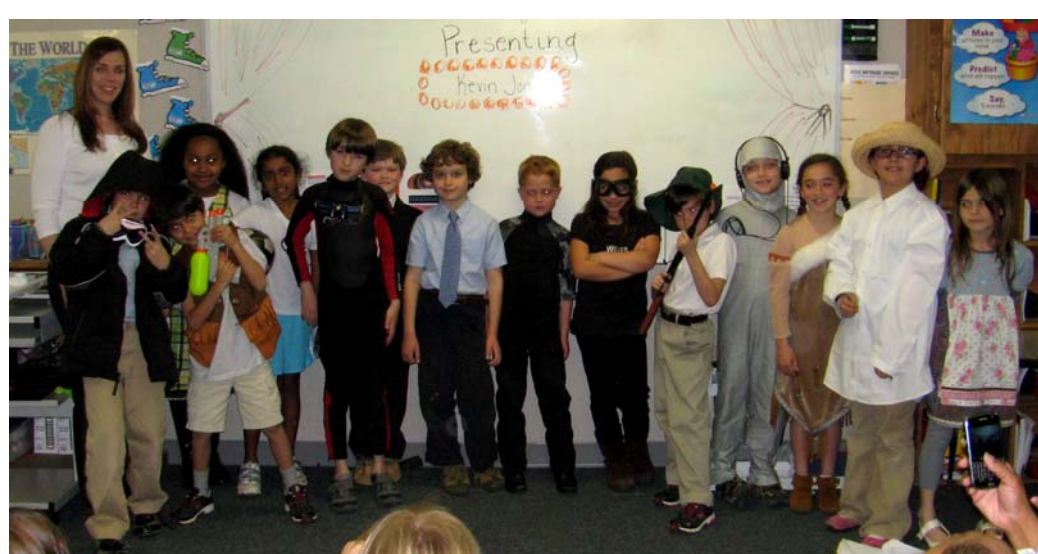
Second graders created a living museum this week. Each student chose a historical figure to portray. Biographies included Van Gogh, Amelia Earhart, Theodore Roosevelt, Martin Luther King, Jr., and more.