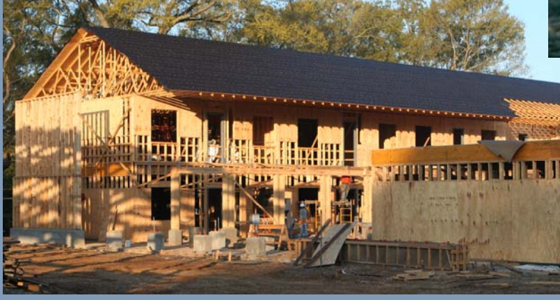
Lower School construction photos here!